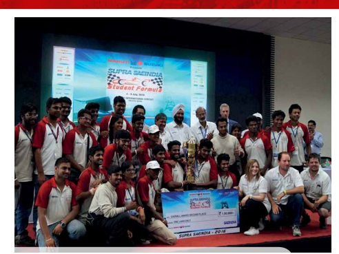
Team interceptors are victors holding the trophy and cash prize