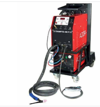
Glory, Victory, Taste of Success, the very car Champ TIG 400P & Hipro TIG 401 Torch