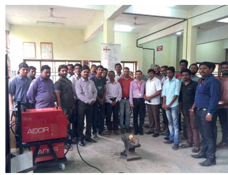
DY Patil college students welcome Ador machine in their labs and perform a Pooja