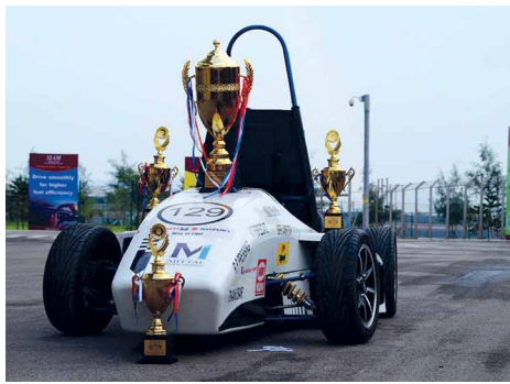
that won it for DY Patil