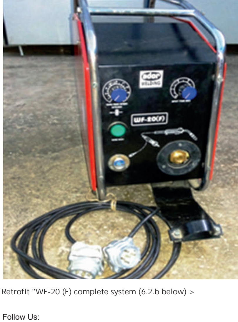
f 😉 in 🛗 🕒