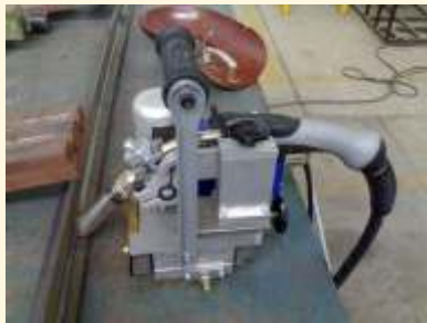
Fillet Welding- Horizontal