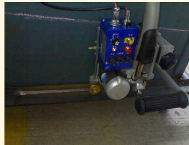
Fillet Welding – Tractor traveling Vertical