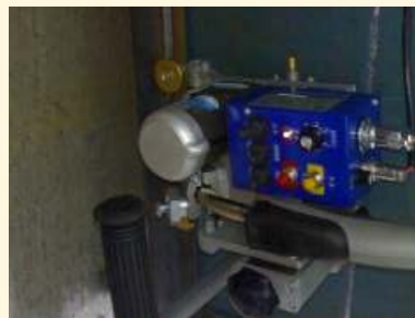
Fillet Welding – Tractor traveling Vertical