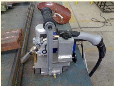
Fillet Welding- Horizontal