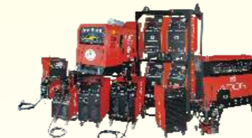
ADOR Cutting & Welding Equipment