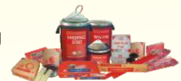
ADOR Welding Consumables