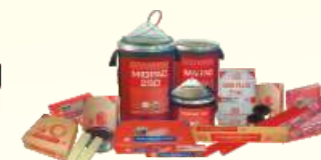
ADOR Welding Consumables